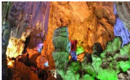
Paradise Palace cave