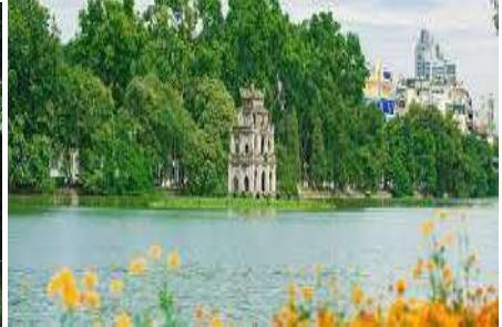
Hoan Kiem Lake