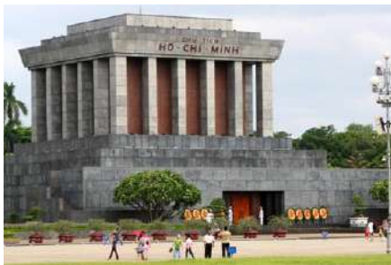
Ho Chi Minh Mausoleum