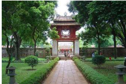
Temple of Literature