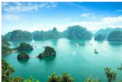
Ha Long Bay

Hanoi – Halong: 165 km => 4 hour transfer included break time on the way