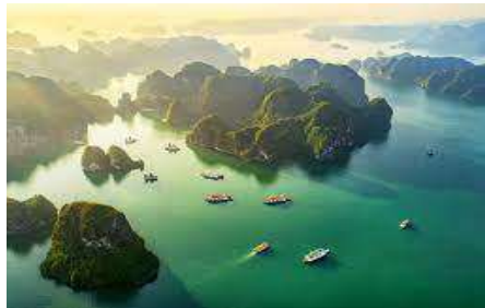
Ha Long Bay